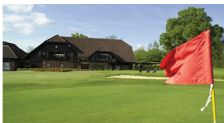
● 18th green and club house.

For information see www.palenduro2010.com and click on the golf event link.